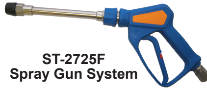
ST-2725F Spray Gun System