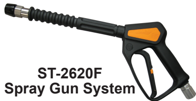
ST-2620F Spray Gun System