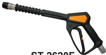
ST-2620F Spray Gun System