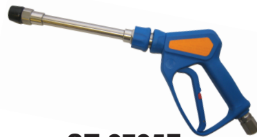
ST-2725F Spray Gun System